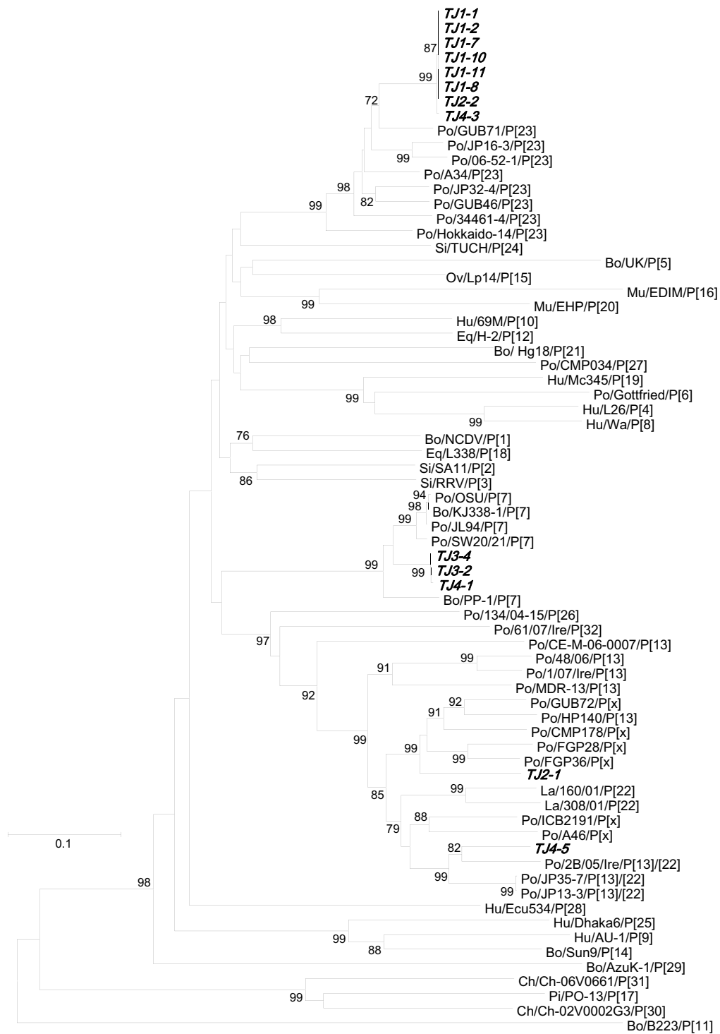
Figure 3 Phylogenetic tree based on the partial nucleotide sequences of the VP8* fragment from GAR VP4 genes identified in this study and those of representative strains of each genotype. Bootstrap values above 60% are shown at the branch nodes. The strains identified in this study are highlighted in bold italic. The strains obtained using GenBank are shown with host species/strain name/genotype. Abbreviations: Hu human, Po porcine, Bo bovine, Ov ovine, La lapine, Si simian, Mu murine, Eq equine, Ch chicken, Pi pigeon, and Tu turkey. The GenBank accession numbers of the strains used in the phylogenetic tree are listed in Additional file 2, Table S2.